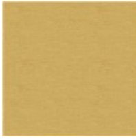
Long Bay Beach