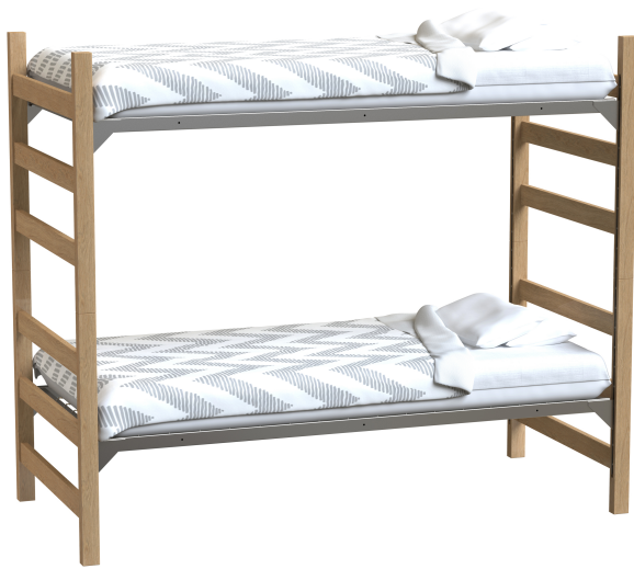
Natural Oak with Silver Spring