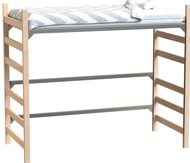
Maple with Silver Spring