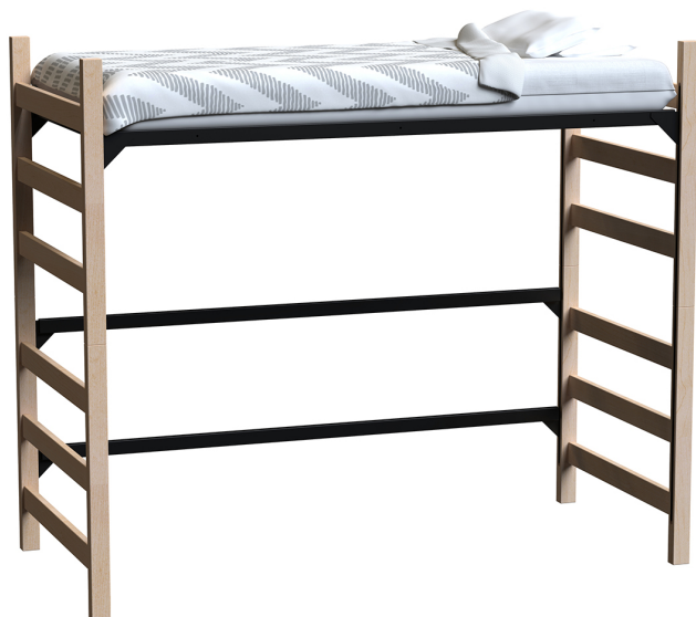
Maple with Black Spring