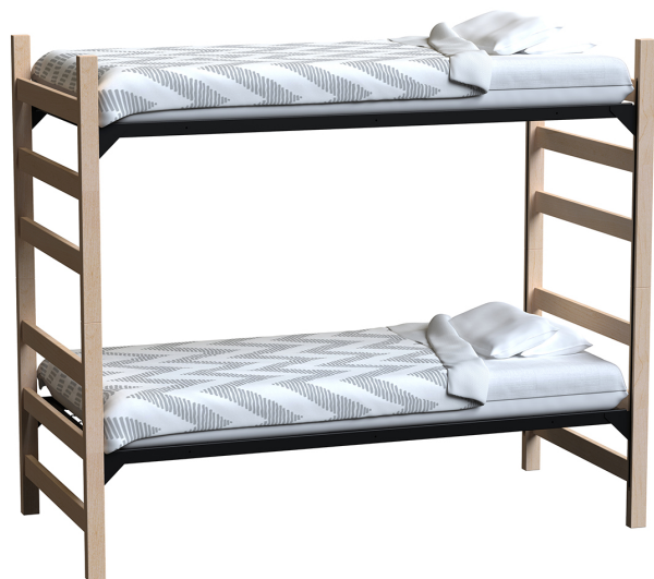
Maple with Black Spring