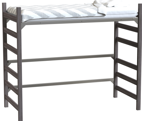
Grey with Silver Spring