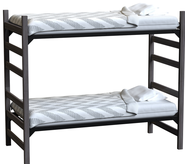
Grey with Black Spring