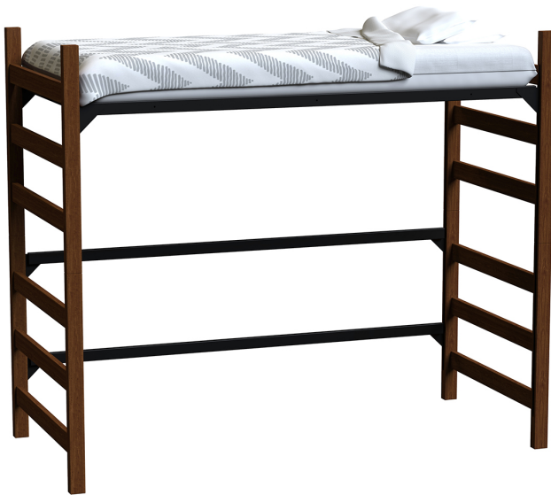
Cherry with Black Spring