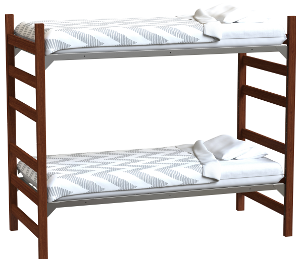
Cherry with Silver Spring